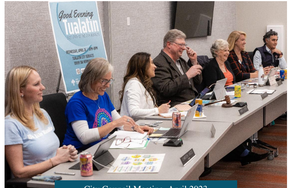
City Council Meeting, April 2023