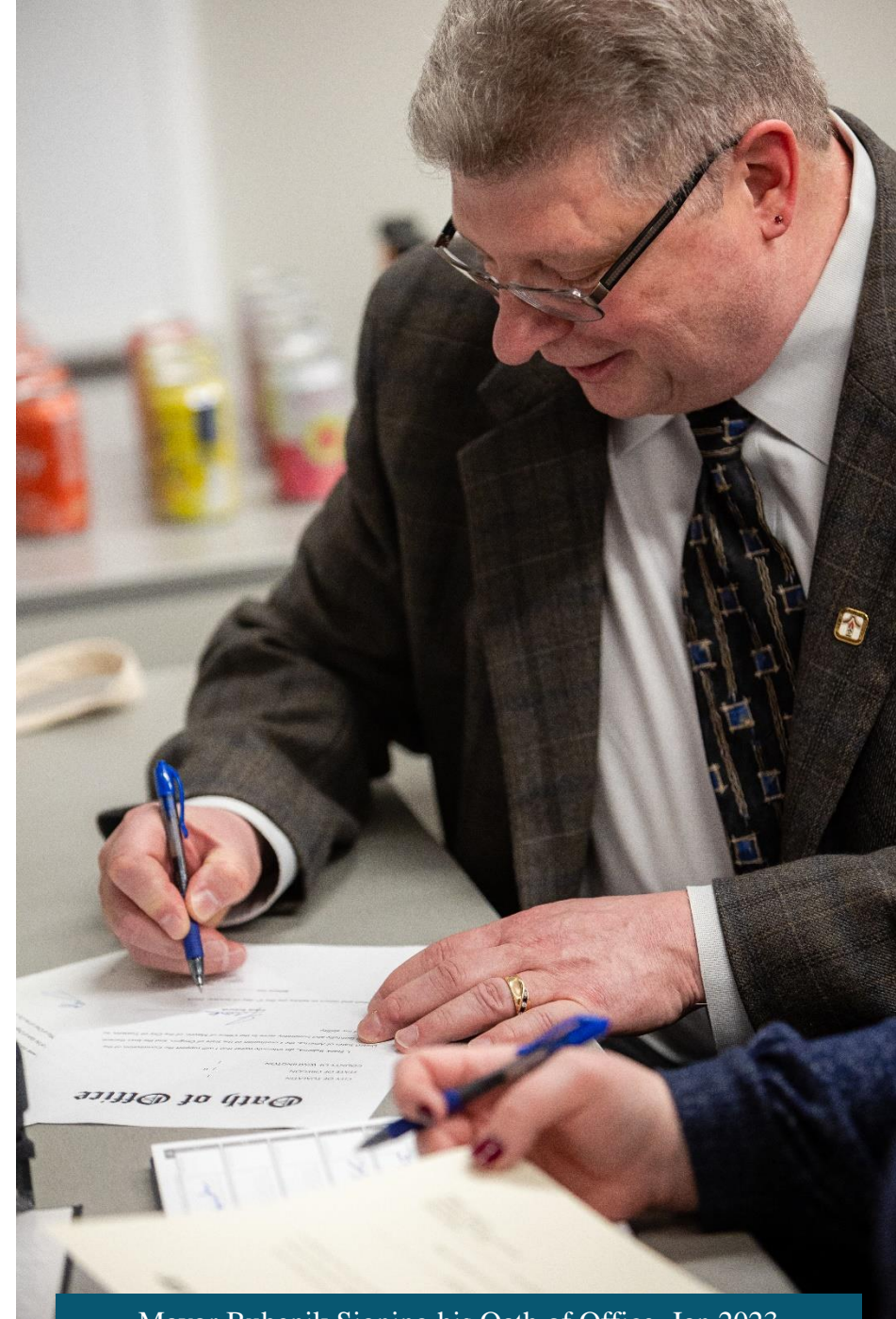
Mayor Bubenik Signing his Oath of Office, Jan 2023