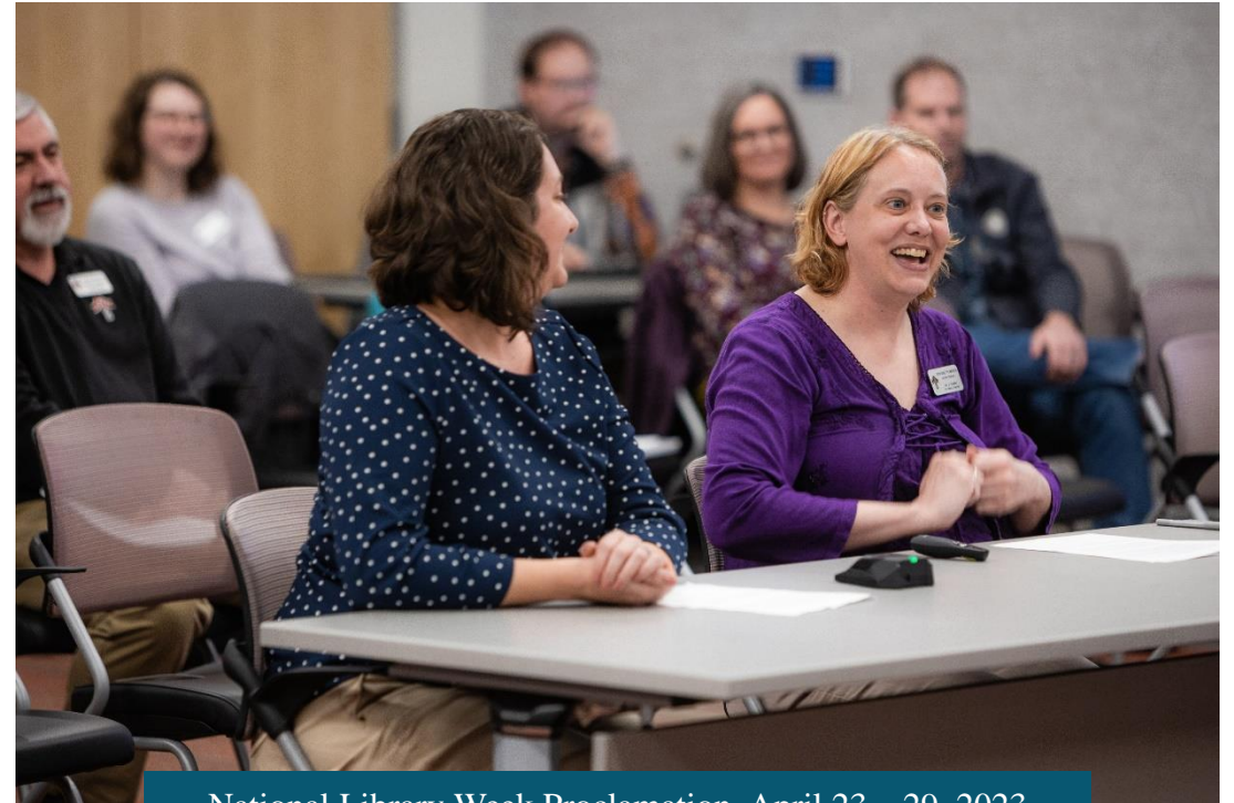
National Library Week Proclamation, April 23 – 29, 2023

➤ “Now, therefore, be it proclaimed by the City Council of the City of Tualatin, Oregon that the week of April 23 - 29, 2023, is National Library Week.”