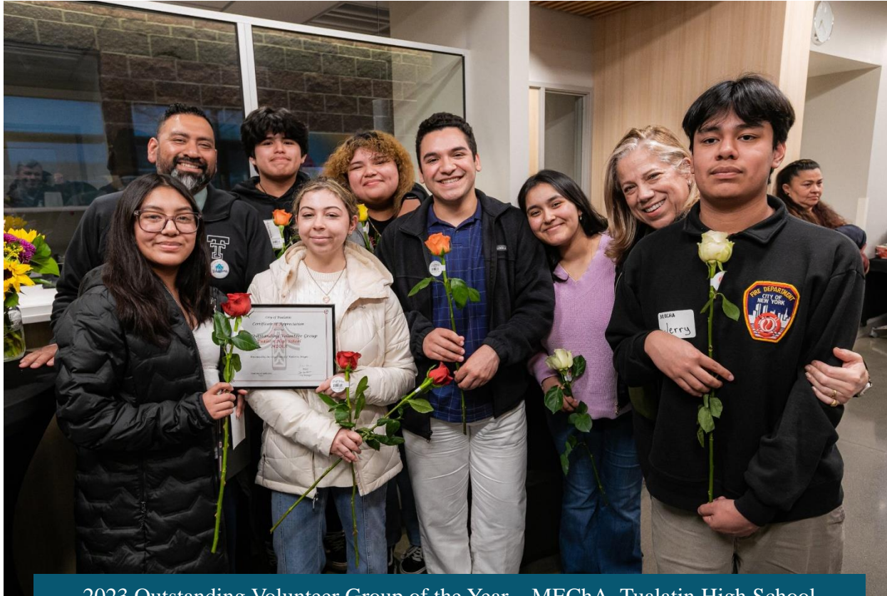
2023 Outstanding Volunteer Group of the Year – MEChA, Tualatin High School